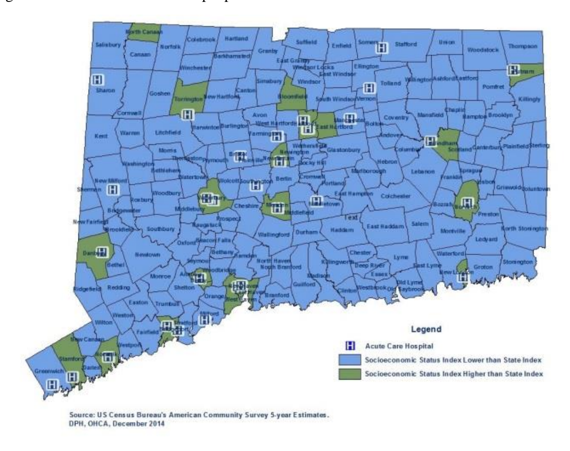
Figure 2: Socioeconomic Status Index, by Town

While this would normally be cause for celebration, these benefits and health outcomes do not accrue evenly. Connecticut residents currently experience the third highest rate of income inequality<sup>14</sup> in the country along with disparities in education, income, and opportunity—all factors that influence health (see Figure 2 ). This is particularly true for residents of Connecticut's larger towns and urban communities, which tend to be more racially and ethnically diverse and home to higher numbers of lower-income people than the rest of the state.<sup>15</sup>